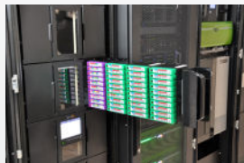
Loading 40 tapes at a time

Your data is critical to your business, but it can be expensive to store all your data. Tape is known for its affordability and Spectra Stack utilizes LTO tape media, a high-capacity tape storage technology designed for dependability and cost effectiveness. It's a powerful, scalable and adaptable tape format that addresses the exponential data growth and storage challenges organizations face today – at the most affordable cost per GB in the industry. For as low as 1 cent per gigabyte, Spectra Stack delivers an extremely reasonable data storage option.