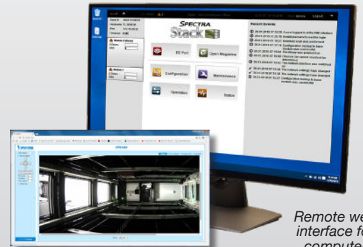
Remote web interface for computer