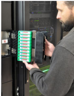
Loading ten tapes at a time