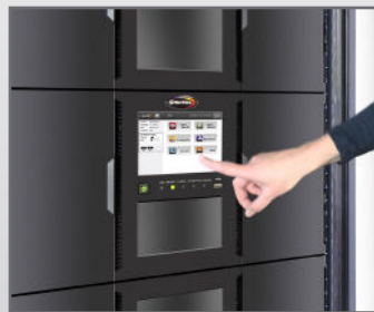
Convenient front panel color touchscreen

Easy to use and manage, the library's management software provides a similar feature set as the rest of the Spectra tape library family, including an intuitive color touchscreen, remote web interface, ability to create partitions (up to 20), built-in diagnostics, media lifecycle management, encryption, and encryption key management. An optional SpectraVision web camera can be mounted on top of the library to provide a visual assessment of all robotics and interior components.