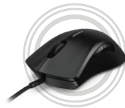
Lenovo Legion M300 RGB Gaming Mouse