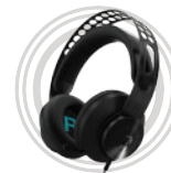
Legion H300 Stereo Gaming Headset